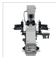
Leica DMI8 – Inverted microscopy platform for micromanipulation